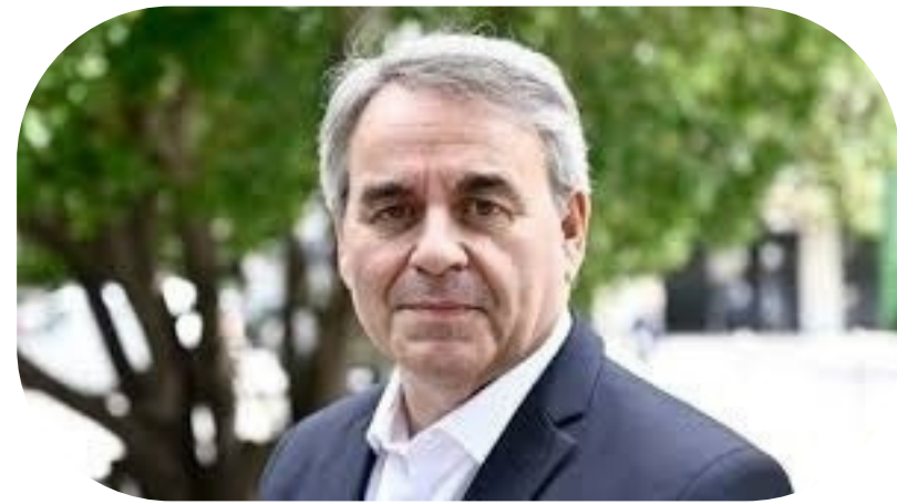
Xavier Bertrand , President of the Hauts-de-France Region